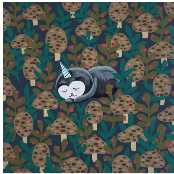
MUSHROOM LADY I / HUG / MUSHROOM LADY II / NAP | 8 x 8 inches | acrylic, gouache on wood panel | $400 each