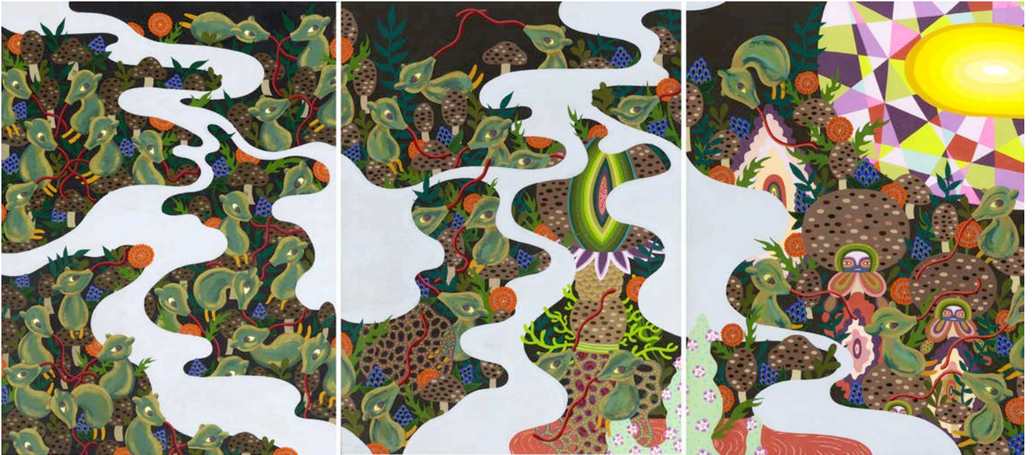
THE LAND OF SHADOW

/// Images are interactive, click for more information or to purchase ///