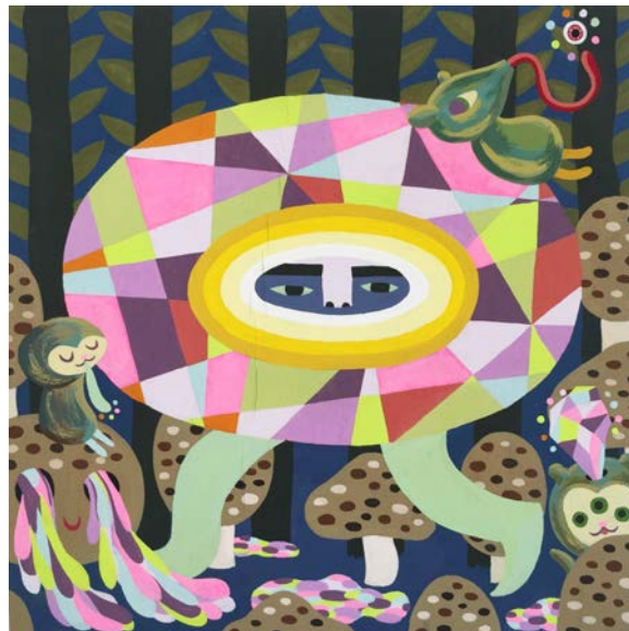
LEFT: SUN | 8 x 8 inches | acrylic, gouache on wood panel | $400